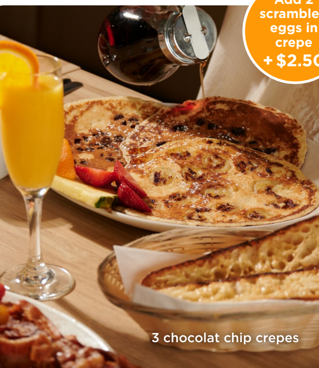
3 chocolat chip crepes