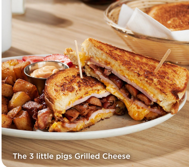
The 3 little pigs Grilled Cheese

Grilled Cheese 18 25 Bacon, ham, sausage, cheese and spicy mayo