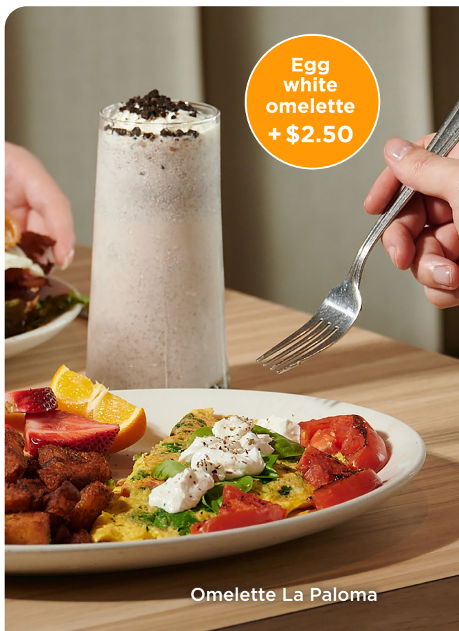
Omelette La Paloma

Change your potatoes into mini poutine (+$3.50) or mini bacon poutine (+$4)