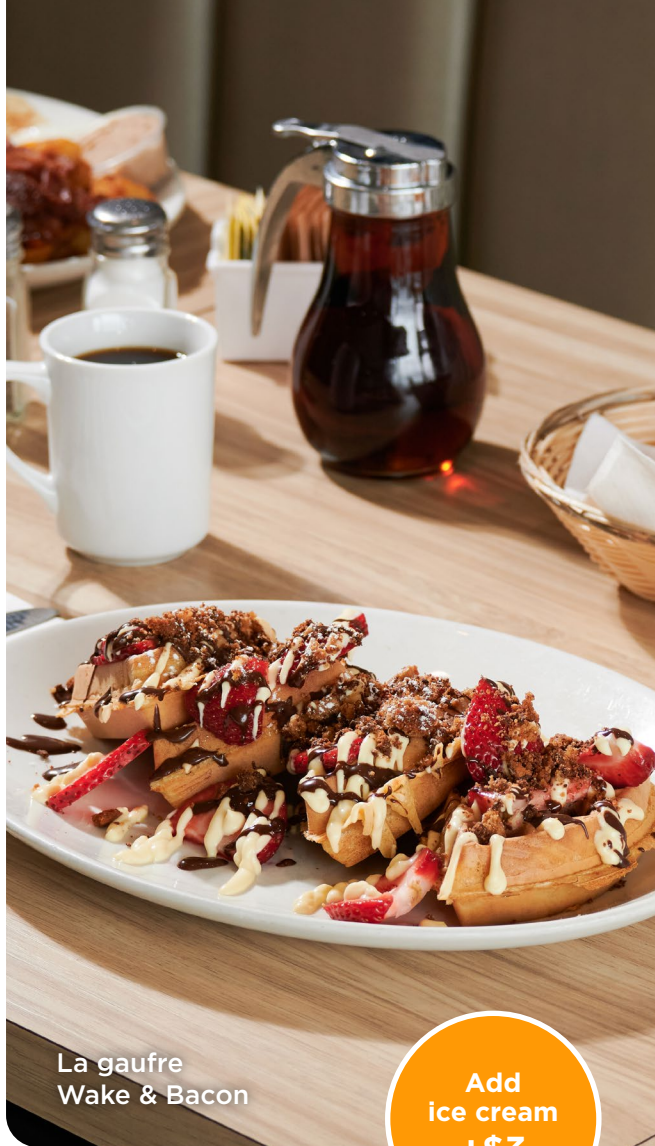
La gaufre Wake & Bacon