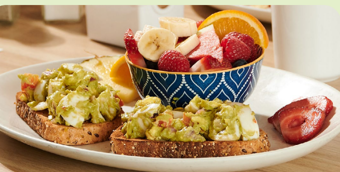
Tartinade à l'avocat avec fruits frais

Melting brie 18 50 Brie, caramelized onions, honey and nuts on an English muffin. Served with fresh fruit