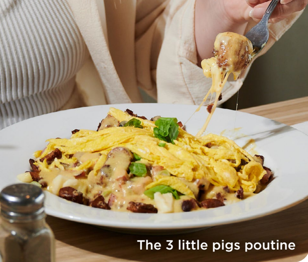
The 3 little pigs poutine