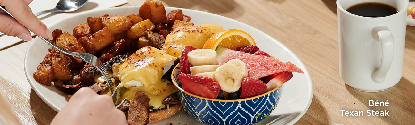
Béné Texan Steak